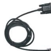
Programming Cable (COM Port) PC21