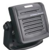
External Speaker SM09S2