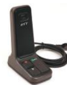
Desktop Microphone SM10R1