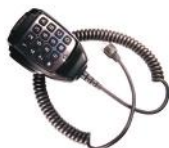
Keypad Microphone SM07R1