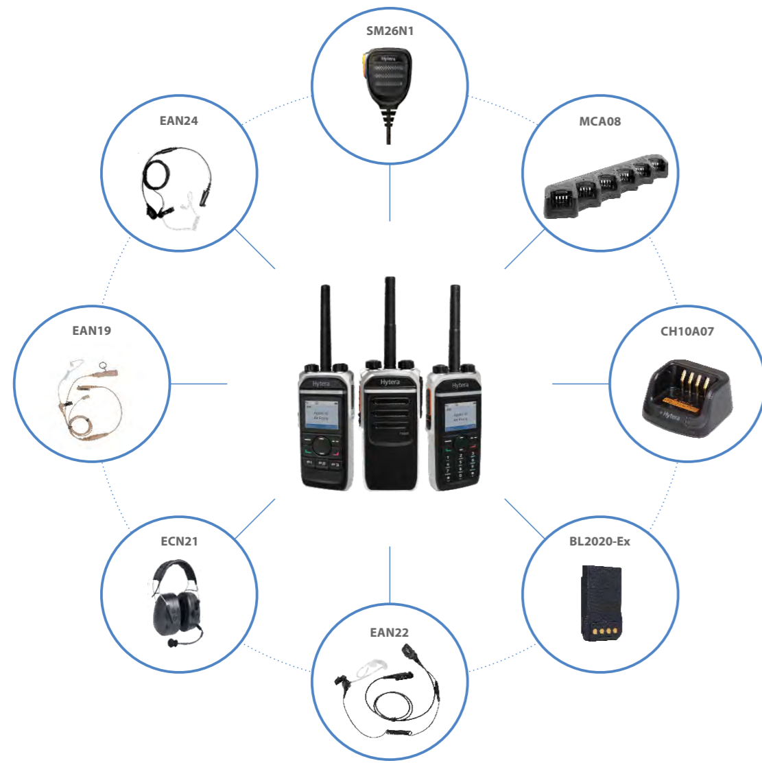
Pictures above are for reference only and may vary from actual products.