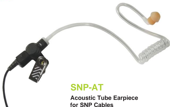
SNP-AT Acoustic Tube Earpiece for SNP Cables