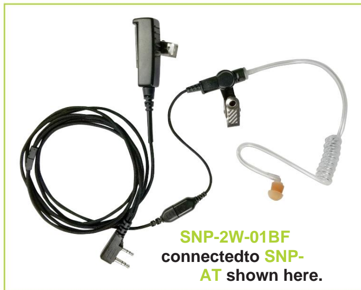
SNP-2W-01BF connected to SNP-AT shown here.