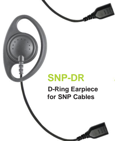
SNP-DR D-Ring Earpiece for SNP Cables