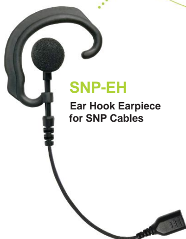
SNP-EH Ear Hook Earpiece for SNP Cables