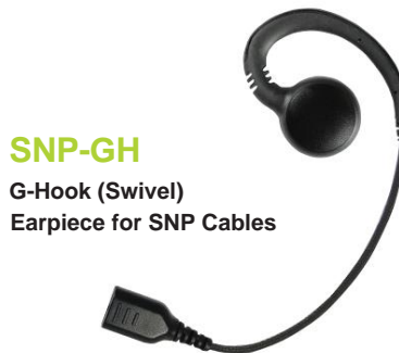
SNP-GH G-Hook (Swivel) Earpiece for SNP Cables