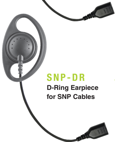
SNP-DR D-Ring Earpiece for SNP Cables