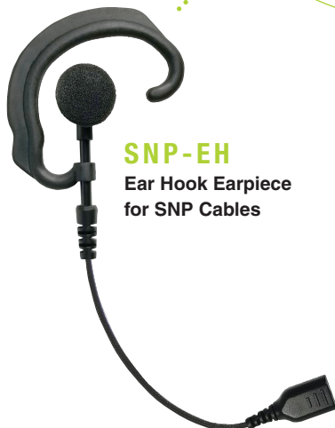
SNP-EH Ear Hook Earpiece for SNP Cables