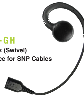
SNP-GH G-Hook (Swivel) Earpiece for SNP Cables