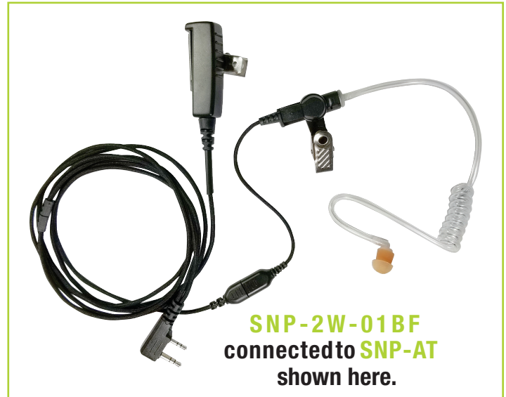
SNP-2W-01BF connected to SNP-AT shown here.