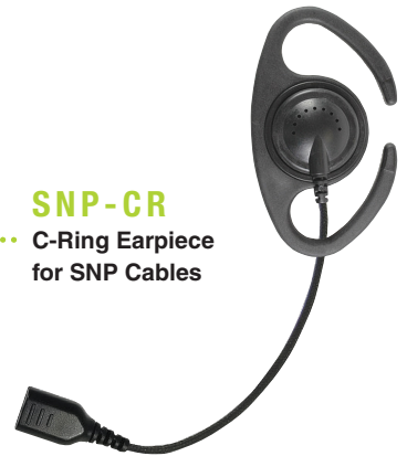
SNP-CR C-Ring Earpiece for SNP Cables